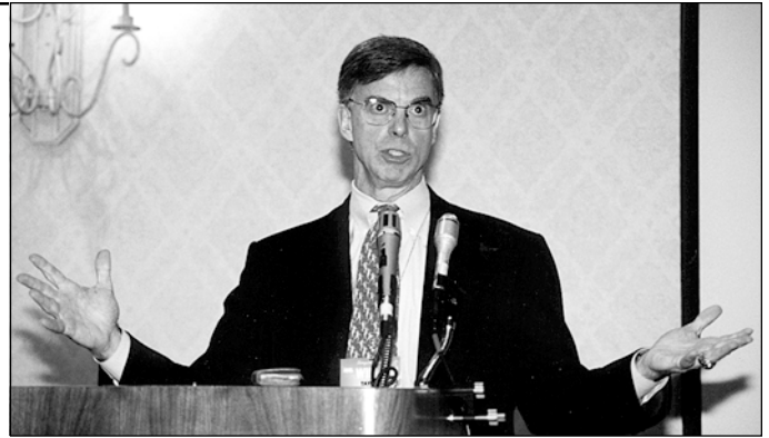
Amb. William Taylor reports on U.S. assistance efforts.