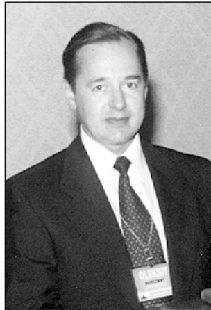
Oleksii Berezhnyi, minister counselor, Embassy of Ukraine.