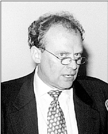
Economist Anders Aslund discusses latest economic developments in Ukraine.